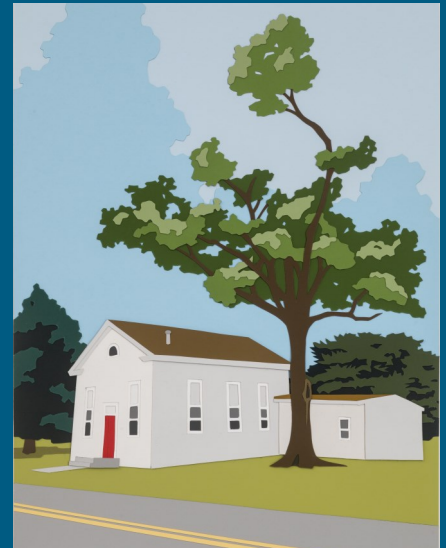
Untitled (Swedesboro) 2015, Paper collage, Casey Ruble

Everything that Rises , an exhibition and public program series at the Visual Arts Center of New Jersey, utilized the artwork of Casey Ruble to generate dialogue on race relations in the U.S. The artist creates contemporary images of local sites with historical connections to the Underground Railroad and the Civil Rights Movement. The project received support from a NJCH Major Grant.