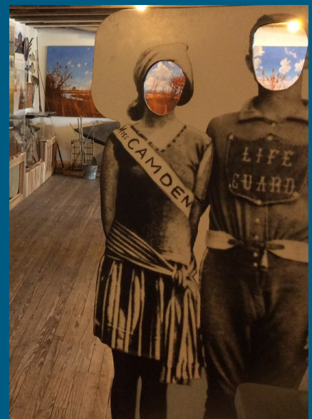
Play on the Baysore , an exhibition and public program series at the Bayshore Center at Bivalve explored how work and play are closely intertwined with each other in New Jersey's Delaware Bayshore. The project received support from a NJCH Major Grant.

Everything that Rises , an exhibition and public program series at the Visual Arts Center of New Jersey, utilized the artwork of Casey Ruble to generate dialogue on race relations in the U.S. The artist creates contemporary images of local sites with historical connections to the Underground Railroad and the Civil Rights Movement. The project received support from a NJCH Major Grant.